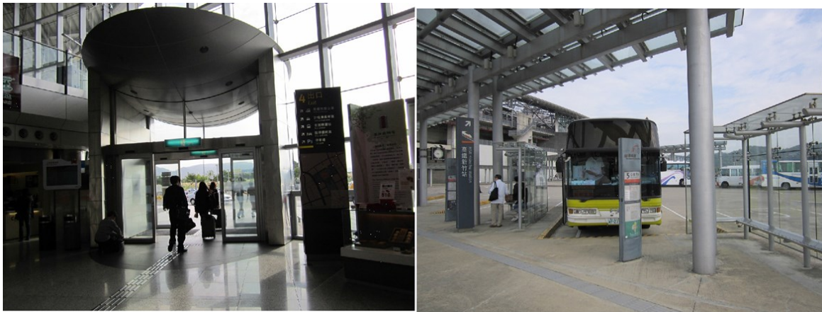
Timetable of free shuttle bus

When arrive at THSR Hsinchu Station → Exit 4 → Platform 5